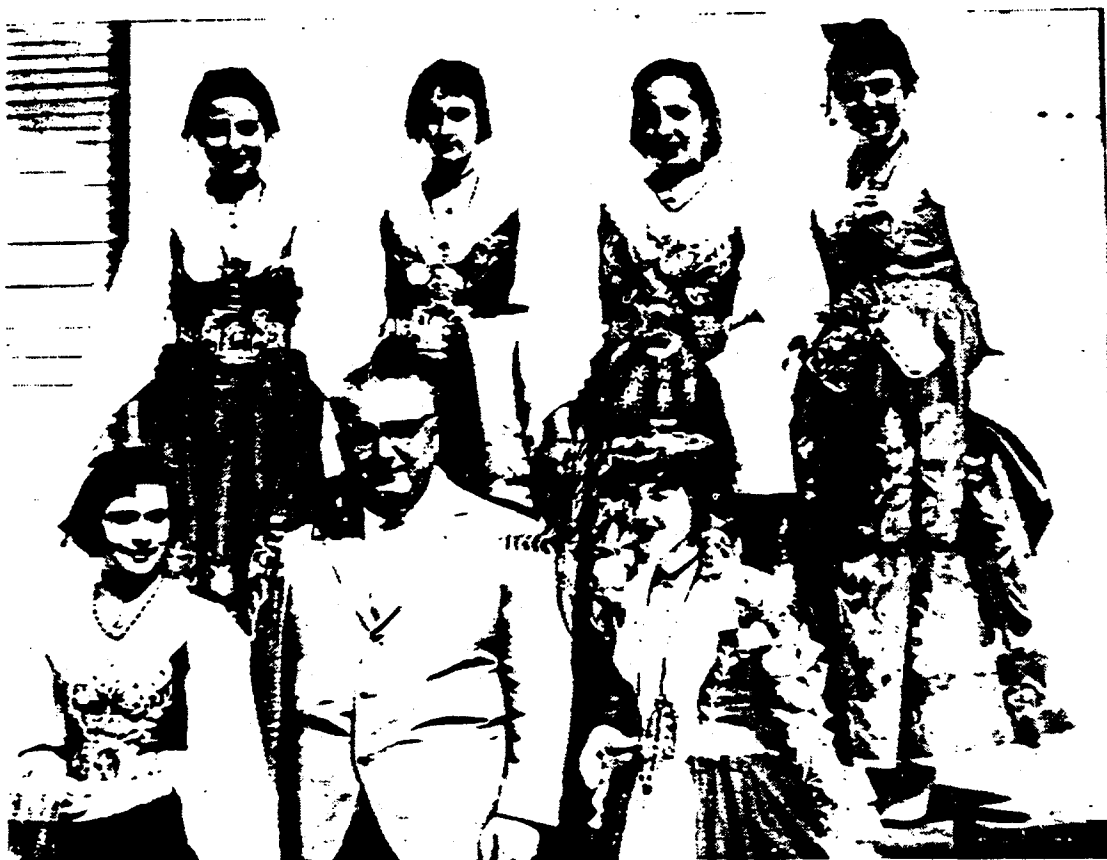
Ernest Koliqi, Albania's best short story writer. (Pictured among the Albanians of Sicily.)

Some of the writers were obliged to go into exile; others remained in the country but stopped writing since there was no longer any freedom to write according to the dictates of their own inspiration.