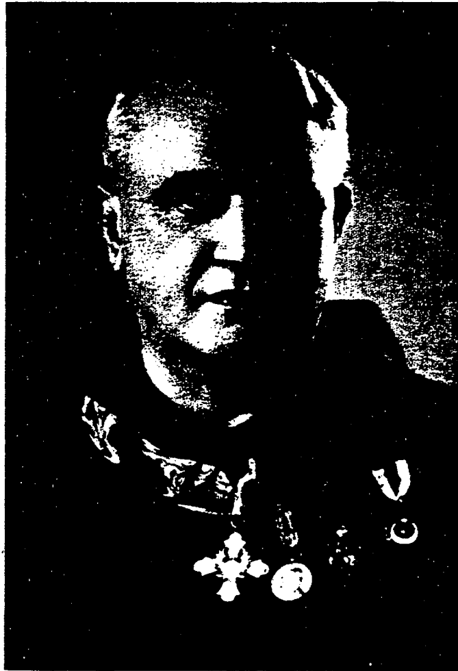
GJERGJ FISHTA (1871-1940)